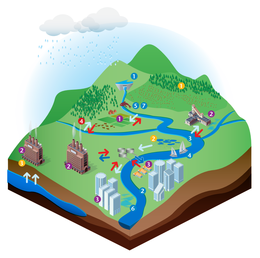
Figure 2– Sample watershed showing off-stream, in-stream and water-related habitat values

Water-related habitat values include values associated with water-related ecosystem functions provided by habitats. This includes, for example, the natural regulation of water flows, control of flooding, and purification of water provided by vegetated habitats and soils, in particular forests and wetland habitats.